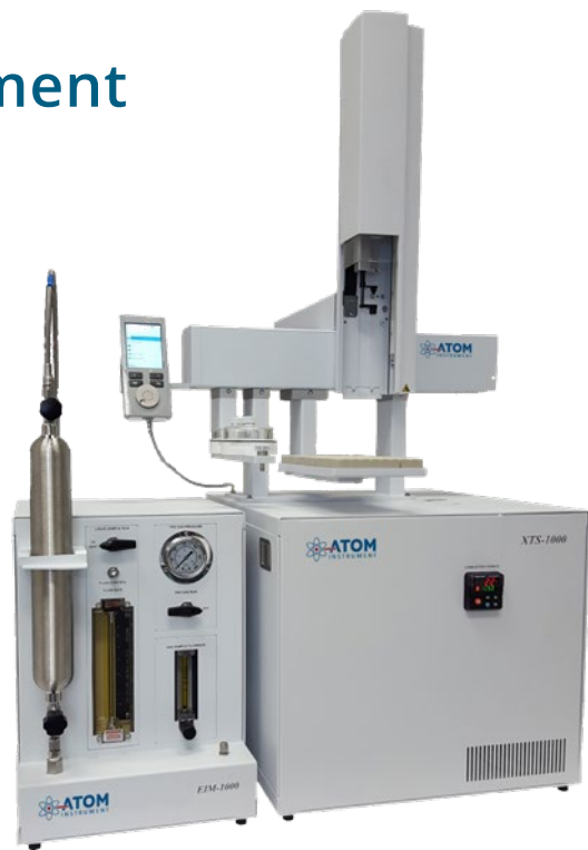
XT Series Analyzer (XTS-1000) with Autosampler (LAS-1000) and External Injection Module (EIM-100).

ATOM Instrument offers the most innovative laboratory analyzers on the market for Total Sulfur and Total Nitrogen measurements. All XT Series Analyzers are designed and built for precise, accurate and reliable analysis with flexibility that allows the measurement of a wide range of samples with a single instrument. Analyzer versatility enables operation with either air or Oxygen-Argon mixtures for combustion. XT analyzers offer rapid analysis combined with the highest dynamic range on the market, which allows measurement of a broad range of samples with a single method using a single calibration. The efficient and compact design reduces required benchtop space to a minimum, while maintaining complete accessibility to analyzer components.